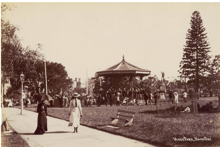
Hyde Park - Band Day 1890s

For the 1916 contest the Band Association of N.S.W. found itself without any money and the possibility of the championship contest being abandoned was contemplated. Better councils prevailed, however, and it was decided to offer the bands a contest on the best terms that could be managed. Total cash prizes of £50/10/0 were announced for the three grades, the first prize in the championship being £10. No less than fifteen bands competed.