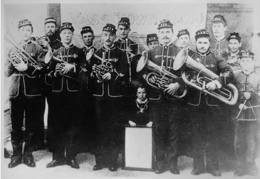
Yass Town Band, 1887