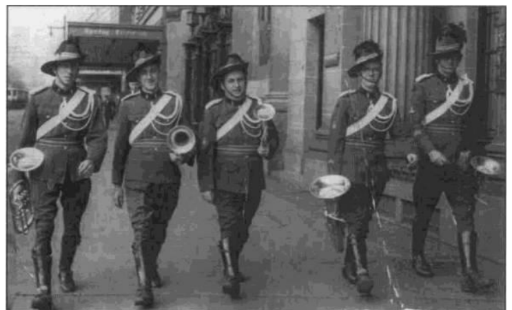
Bandmen in Sydney C1939