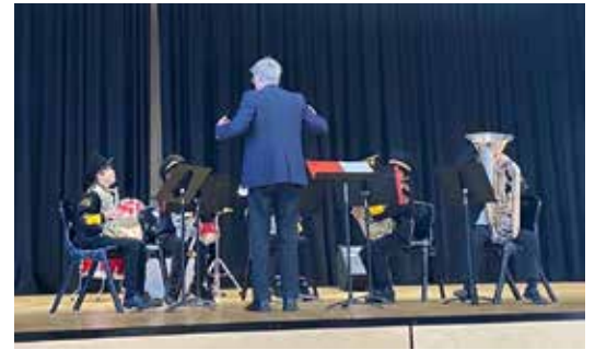
Under 13 Quintet prepares to play.