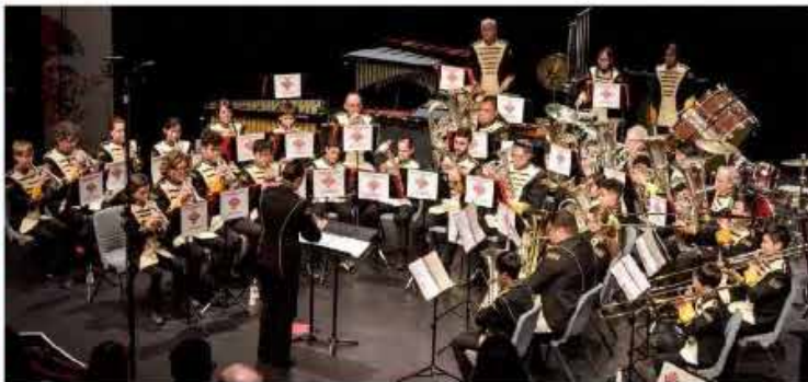
St George Brass Band