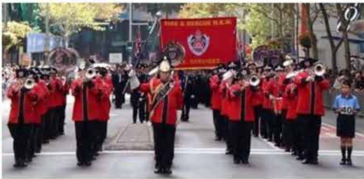
Fire + Rescue NSW Band

WELCOME TO THE MUSIC PERFORMANCE BY FOUR LOCAL BANDS: