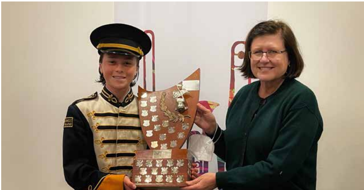
U 15 Brass Champions of Champions