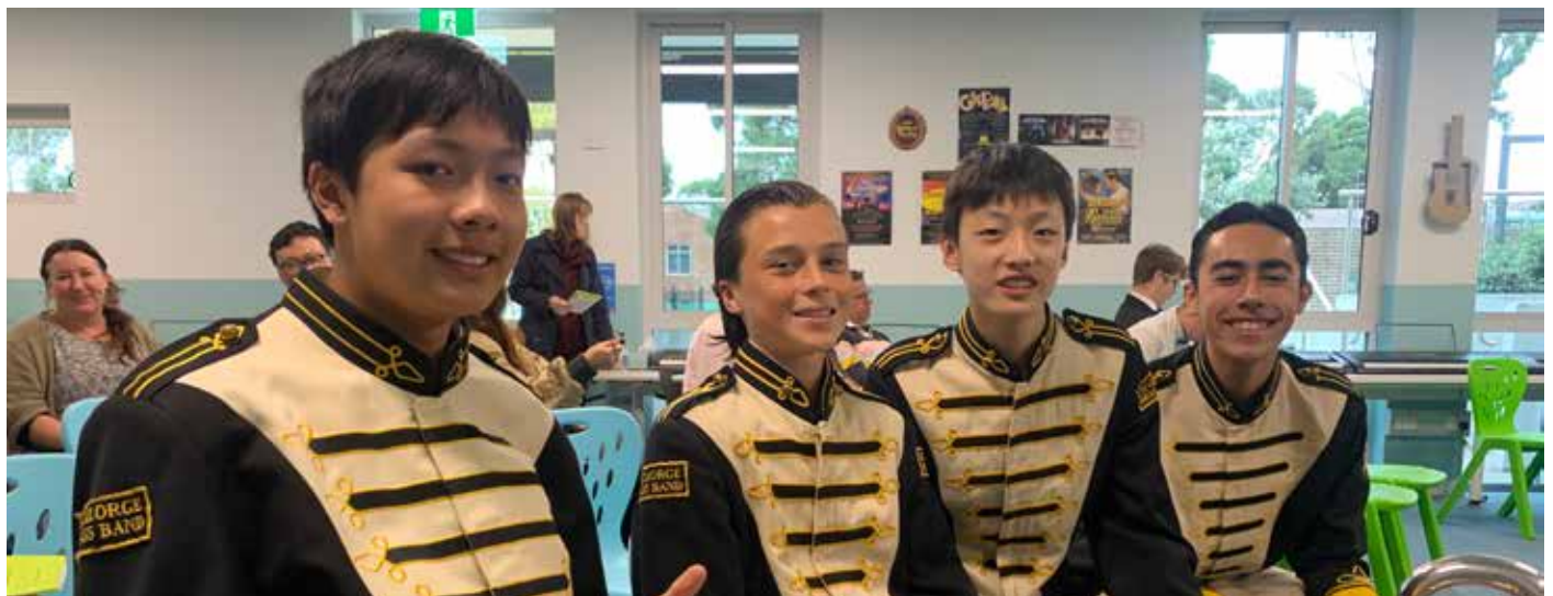
In the warm-up room

In August, we expect to have two bands in the State Championships. I know that everyone is looking forward to contesting live again.